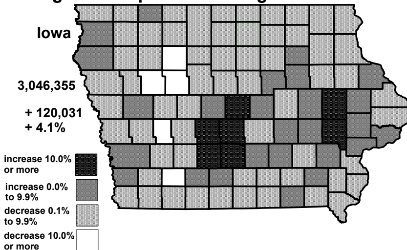
Figure 1. Population Change 2000 - 2010

In recent decades, significant numbers of counties have registered a population decline at a census. Between 1990 and 2000, 45 counties experienced a population loss while 54 showed a gain. The decade of 1980 to 1990 was especially hard on Iowa's population. During that time, Iowa lost 4.7 percent of its residents (-137,000) with 92 counties showing population loss (Figure 2).